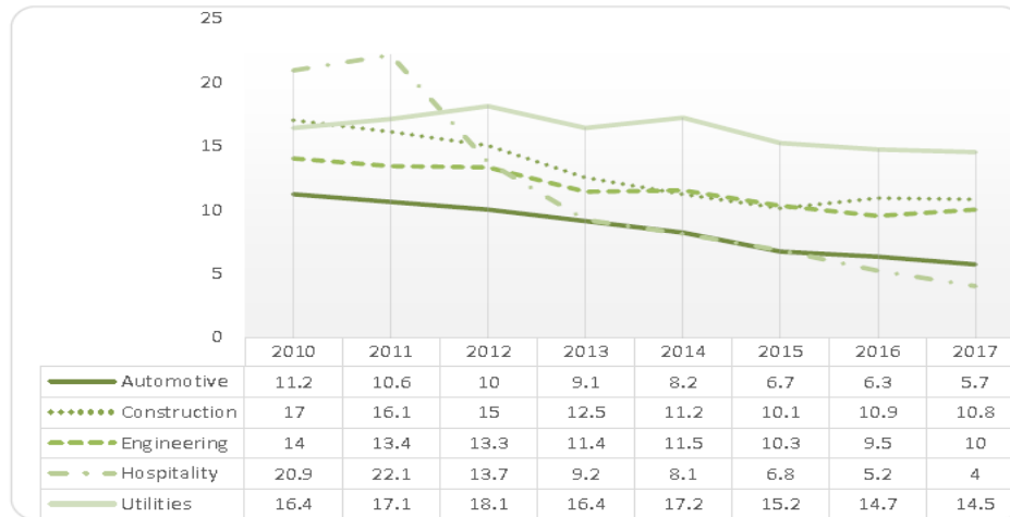
Graph 4 - GTO Apprenticeship Market Share – top 5 Industries in 2010